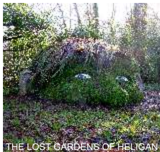
THE LOST GARDENS OF HELIGAN