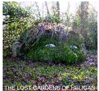
THE LOST GARDENS OF HELIGAN