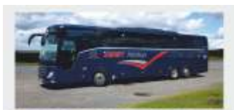
MERCEDES COACH SEATING PLAN

Please note all itineraries & details in this brochure are subject to change as circumstances dictate.